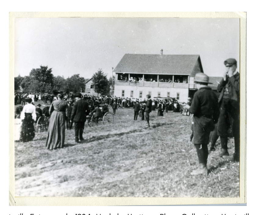
Image: Huntsville Fairgrounds, 1904.

Core Values: Inclusion, Compassion, Community, Fun