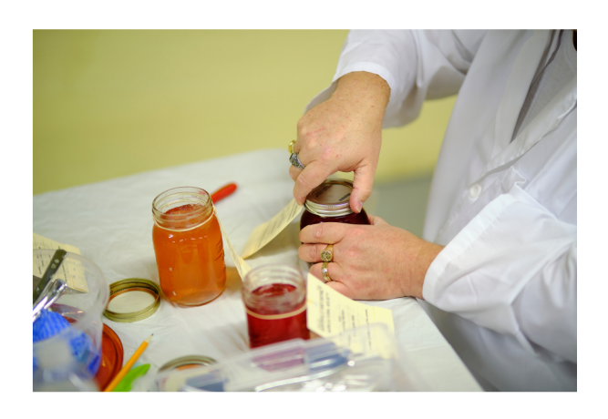
Fruit - sealed in 250 ml jars or larger